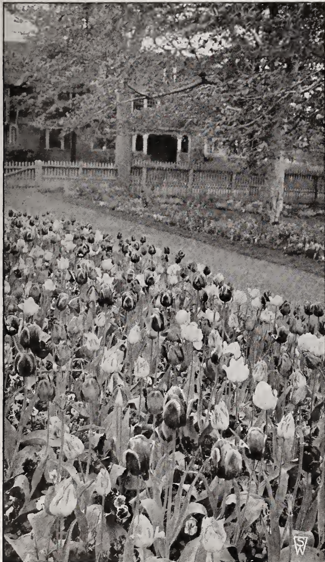
A border of Single Early Tulips

Augusta. B 10. An improvement on the old variety Rose Gris-de-Lin, but very much larger in size. A wonderful exhibition variety.....$0 85 $6 00 $58 00